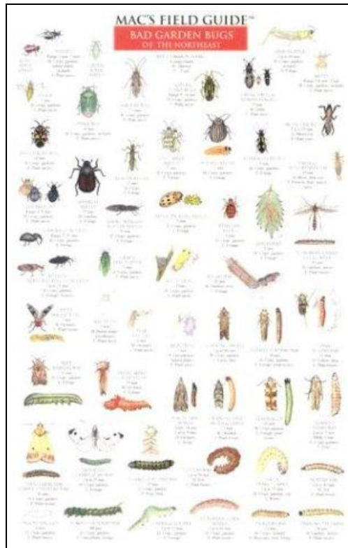
Filesize: 4.24 MB